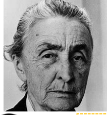
Artist - Georgia O'Keefe