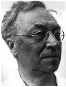
Artist - Kandinski

Y1 - 3d Form Manipulate clay in a variety of ways, e.g. rolling, kneading and shaping. Explore sculpture with a range of malleable media, e.g. specially clay. Experiment with, construct and join recycled, natural and man-made materials. Explore shape and form.